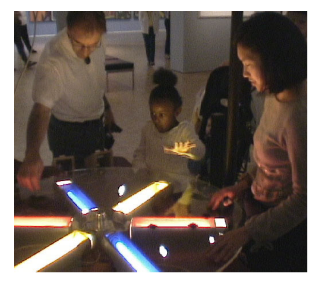
Figure 1. Participants moving tokens and experimenting with the COOL.

The platter is a disc of clear acrylic, mounted on a spindle recovered from a large computer hard disk. The spindle is bolted onto a welded steel hexagonal box that acts as the structural hub of the device. Long incandescent light bulbs are mounted on the box, and extend outward in six directions. Light from the bulbs shines up through acrylic plates of varying colors. Support arms made