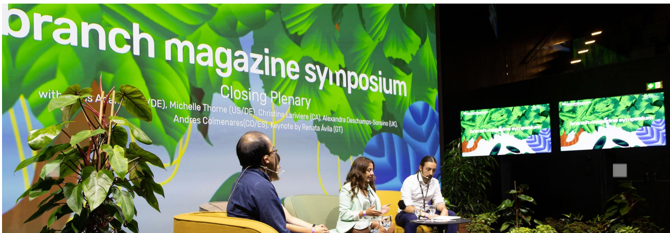
Branch Magazine Symposium

Every year since 1987, the Prix Ars Electronica has been searching for the world’s best computer animations. An exquisite selection of these can be seen during Ars Electronica in the form of the specially curated Animation Festival. Equally extraordinary is the lineup we’ll be showing you in the Ars Electronica Center ’s Deep Space 8K . On 16 by 9 metre projections on the wall and floor, artists from all over the world stage visual worlds in 8K resolution that will blow your mind. Guaranteed!