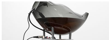
Media art from Latin America