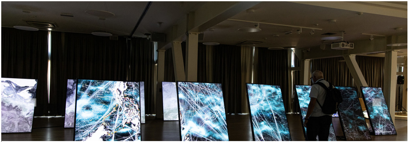
Oceans in Transformation / Territorial Agency