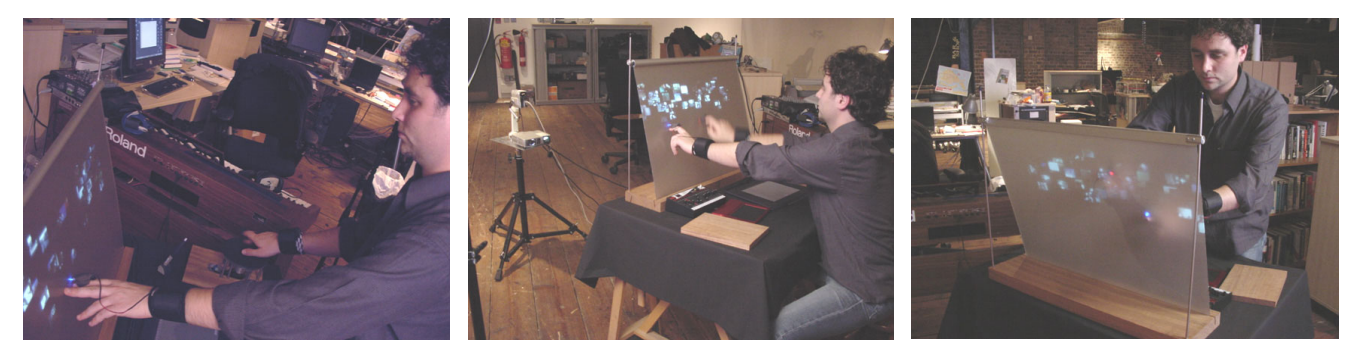
Figure 6. our Live Cinema instrument.

We use rear-projection on a high-contrast Reversa screen (extruded acrylic containing diffusing polymer beads). Finger tracking is vision-based. A color camera is pointing at the back of the screen, so the LEDs can be seen through when the fingers are very close to the screen. To reduce CPU load, we filter optically as much as possible : 1. by perpendicularly polarizing projection and camera with filters, so that only LEDs are seen and not the projected image ; 2. by closing down the shutter to the minimum so that the captured image is black save for small clusters of