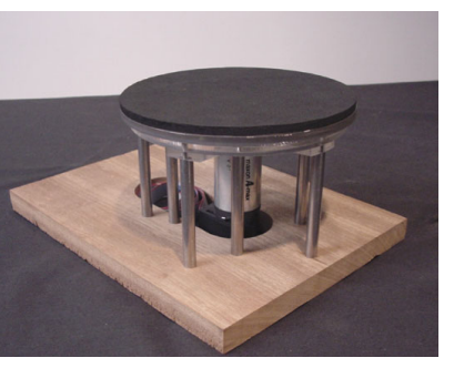
Figure 7. Video drum.

Time only has two topologies : linear or circular [9]. In our prototype, we were using a linear controller. Here, we decided to use a circular disc-based controller, time back the bringing looks of oldfashioned Steenbeck editing decks.