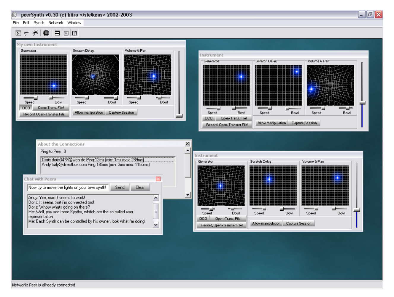
Figure 3: peerSynth user interface with 3 users connected over a P2P network. More information from www.peersynth.com